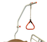
Trapeze Patient Helper