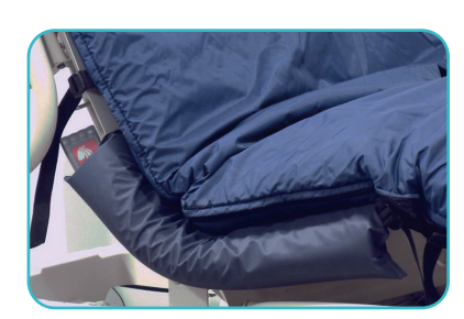
Optionally available for Step-Deck Frames

Prevents and treats wounds by simulating immersion of the patient in a fluid medium