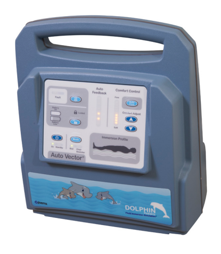
Immerse Your Patients in Healing www.DolphinFIS.com

Initially developed for dry transport of specially trained U.S. Navy dolphins, Dolphin Fluid Immersion Simulation (FIS) is a unique breakthrough technology that automatically simulates a fluid environment, maintaining near normal blood flow, minimizing soft tissue distortion, and optimizing tissue oxygenation. The Dolphin Pediatric FIS System addresses the wound healing and prevention needs of clinically complex pediatric patients providing enhanced patient comfort, improved clinical outcomes, and better clinician ergonomics.