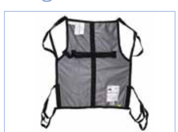
One Piece Sling with Positioning Strap