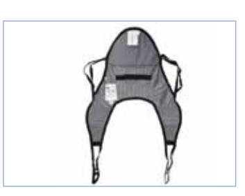
U-Sling, Padded with Head Support