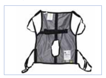
One Piece Commode Sling with Positioning Strap