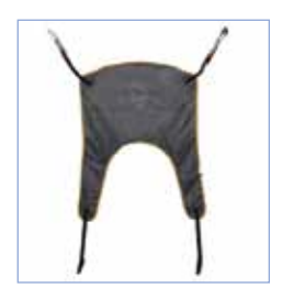
Quick Fit • Weight Capacity: 850 lbs.