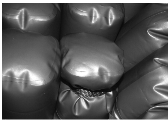
Figure 4 Reduce cell by securing around cell