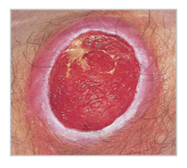
Stage 3: Full-Thickness Skin Loss

Partial-thickness loss of skin with exposed dermis. The wound bed is viable, pink or red, moist, and may also present as an intact or ruptured serum-filled blister. Adipose (fat) is not visible and deeper tissues are not visible. Granulation tissue, slough and eschar are not present. These injuries commonly result from adverse microclimate and shear in the skin over the pelvis and shear in the heel. This stage should not be used to describe moisture associated skin damage (MASD) including incontinence associated dermatitis (IAD), intertriginous dermatitis (ITD), medical adhesive related skin injury (MARSI), or traumatic wounds (skin tears, burns, abrasions).