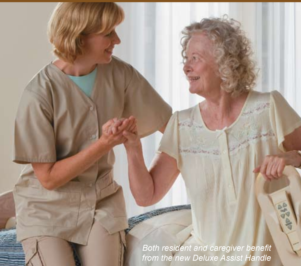
Both resident and caregiver benefit from the new Deluxe Assist Handle