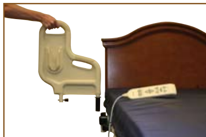
Easily removed for storage.