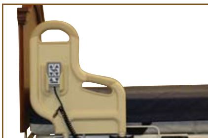
Deluxe assist handle shown with both pendant holder styles.