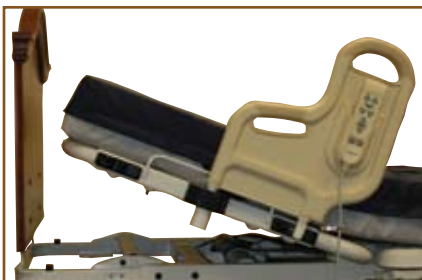
Deluxe assist handle stays with the bed frame and resident.