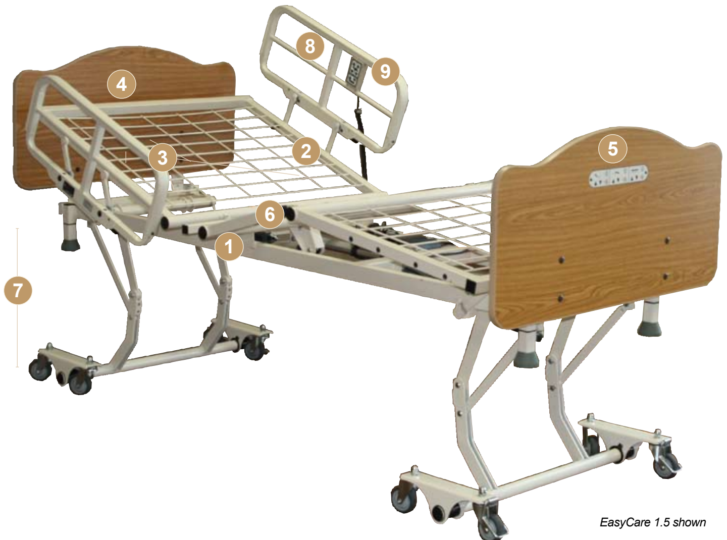
EasyCare 1.5 shown