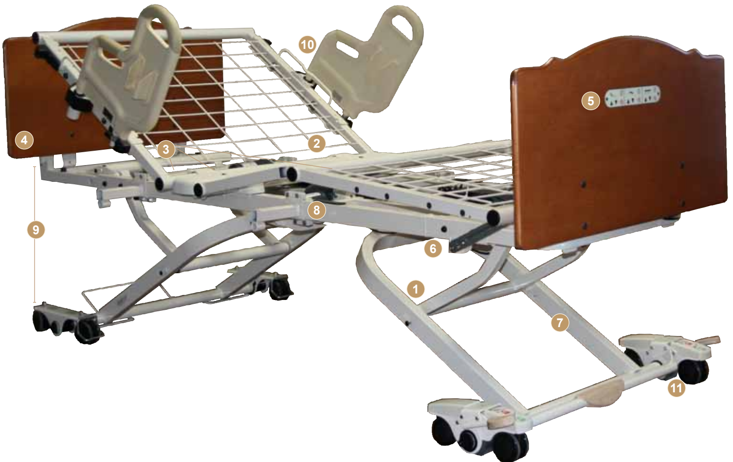
EasyCare 7 shown